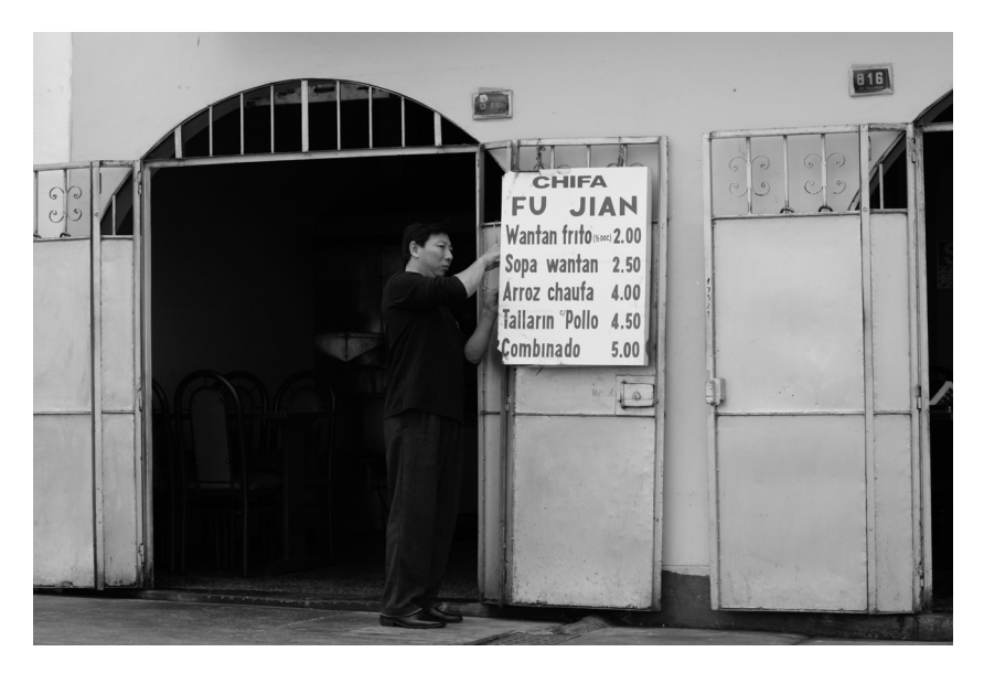
Fujian immigrant who has taken over a small chifa (Chinese restaurant) in a popular neighborhood in Lima.

Pluto Street in Lima's Chinatown. Since 2000 there has been a significant increase in the number of internet parlors that allow new migrants to keep in touch with their relatives in China and the Chinese diaspora elsewhere.